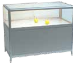
SH-C1 Glass Display Case (1/3 view) 48" W x 24" D x 36" H