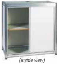
603 Counter Storage Unit, white 42" H x 42" W x 18" D