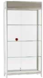
SH-F1 Tower Showcase with 3 glass shelves 40" W x 16" D x 79" H