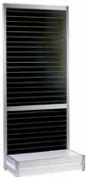
702 Slatwall Shelving Unit 8' H x 40" W