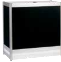
803 Counter Storage Unit 41" H x 41" W x 20" D