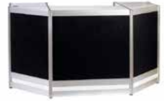
801 U-Shaped Counter, open back 41" H