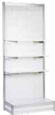
704 Pegboard Shelving Unit 8' H x 40" W

Holes are 1/4" diameter. 3 shelves included. Hardware not included.