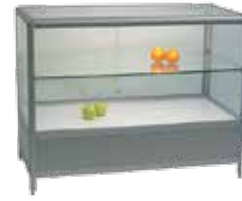
SH-C2 Glass Display Case (Full view) 48" W x 24" D x 36" H