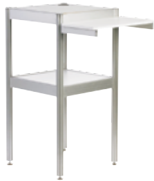
601 Computer Stand 41" H