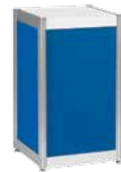
802 20" Square Pedestal 36" H

*Sold as individual panels. Can be attached together in many configurations.