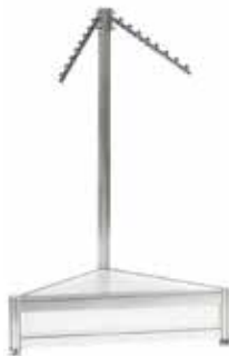
701 Bag Stand Holder