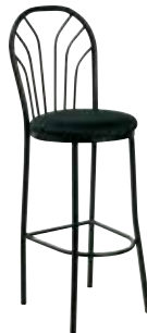
117 Fan Back Stool, black leather