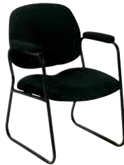
103 Executive Chair, black fabric