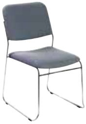
102 Side Chair, grey fabric