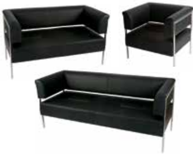
C-SS-48 Stronco Open Back Sofa, black (3 seater)