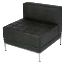
C-SS-67 Square Back, Single Chair, black