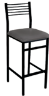
118 Wire Back Stool, grey fabric