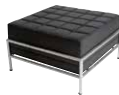
C-SS-68 Square, No Back Ottoman, black