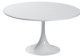
105 Round White Ped Table 18" H