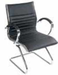
C-OF-13 Ripple Back, Black Leather Sled Base Meeting Chair