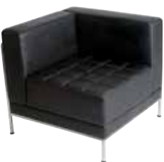
C-SS-66 Square, L-shaped Back Single Chair, black