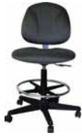
121 Steno Chair, grey fabric