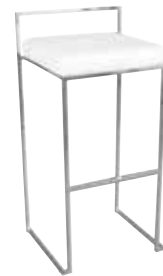
C-BS-11 Hannah Bar Stool, white seat