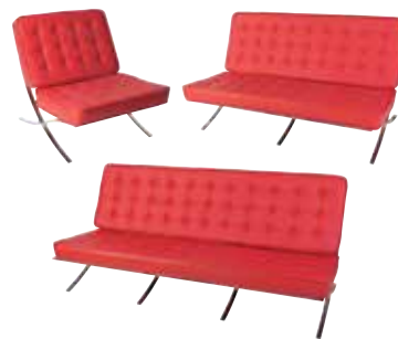
C-SS-32 Barcelona Red Sofa (3 seater)