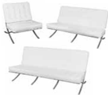
C-SS-28 Barcelona White Sofa (3 seater)