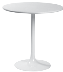
104 Round White Ped Table 30" H