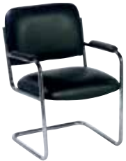
112 Executive Chair, black leather