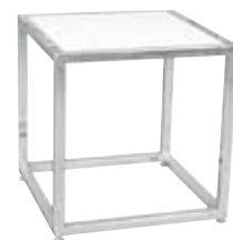
C-ET-10 Chrome End Table, square, white plexi 18" x 18"