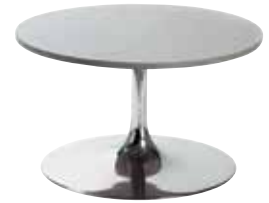
120 Round Ped Table, grey top, chrome stand 18" H