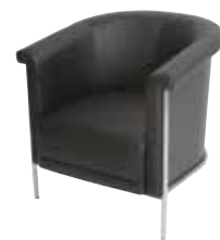
C-SS-8 Black Leather Round Back Tub Chair