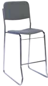
106 Counter Stool, grey