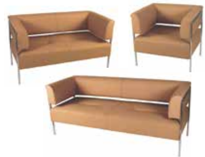
C-SS-54 Stronco Open Back Sofa, sand (3 seater)