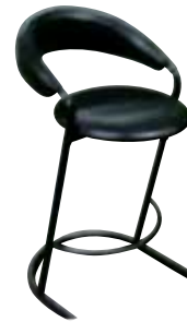
110 Banana Stool, black leather