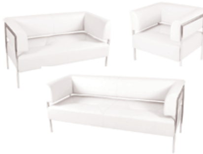
C-SS-51 Stronco Open Back Sofa, white (3 seater)