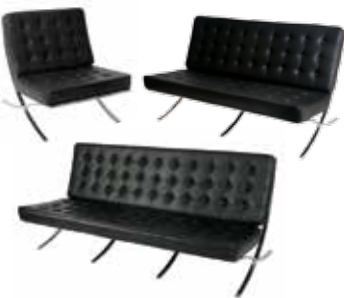
C-SS-24 Barcelona Black Sofa (3 seater)