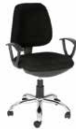
C-OF-16 Steno Chair, black fabric