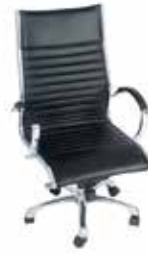
C-OF-11 Ripple Back, Black Leather Executive Meeting Chair