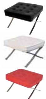
C-SS-27 Barcelona Black Foot Stool